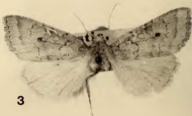
FIG. 3. Spartiniphaga inops , ♂, Mystic, New London Co., Conn., 1 Sept. 1925, leg. H. P. Wilhelm (YPM).

Male genitalia. Illustrated in Figs. 4a and 4b. Differences from S. inops (Figs. 5a, 5b) are listed in Table 1. The easiest characters for practical use are the size and shape of